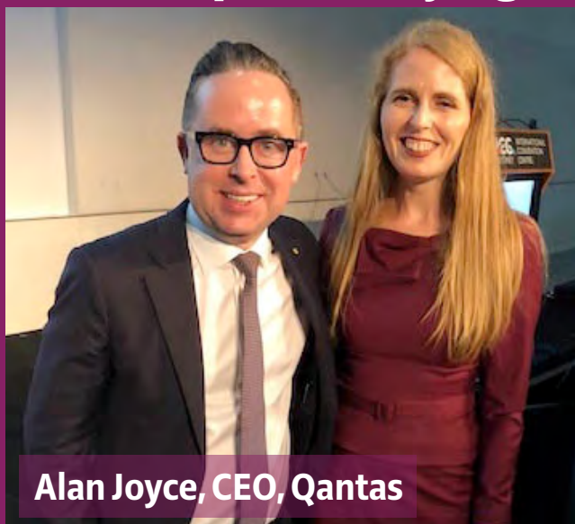
Alan Joyce, CEO, Qantas